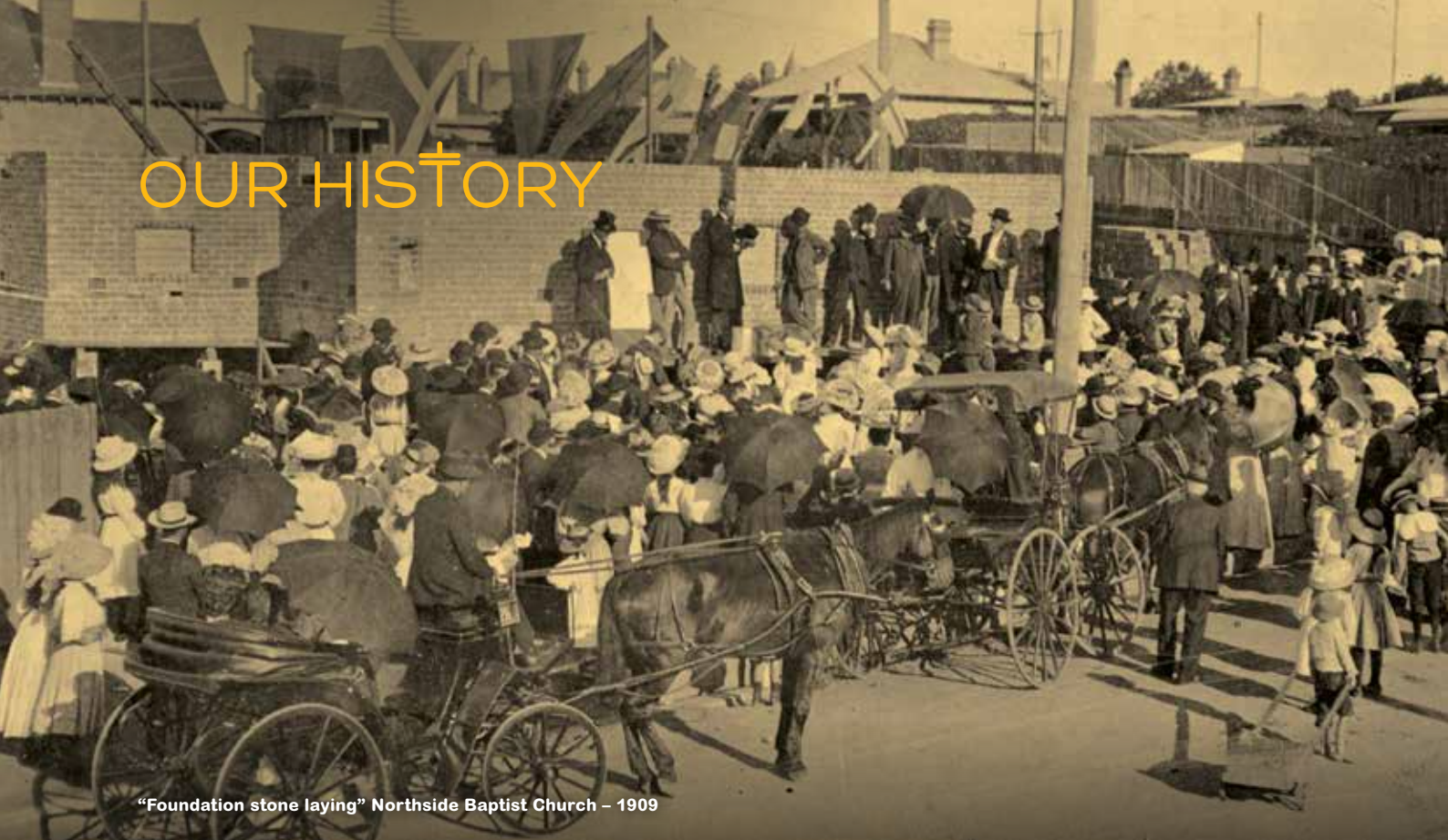
“Foundation stone laying” Northside Baptist Church – 1909

In 2018 the Baptist Association of Churches in NSW & ACT celebrated its 150th anniversary. The Baptist Association, as a voluntary network of churches, holds a common theological belief framework, purpose, values and vision. We work together to further the Gospel of Jesus in word, sign and deed.