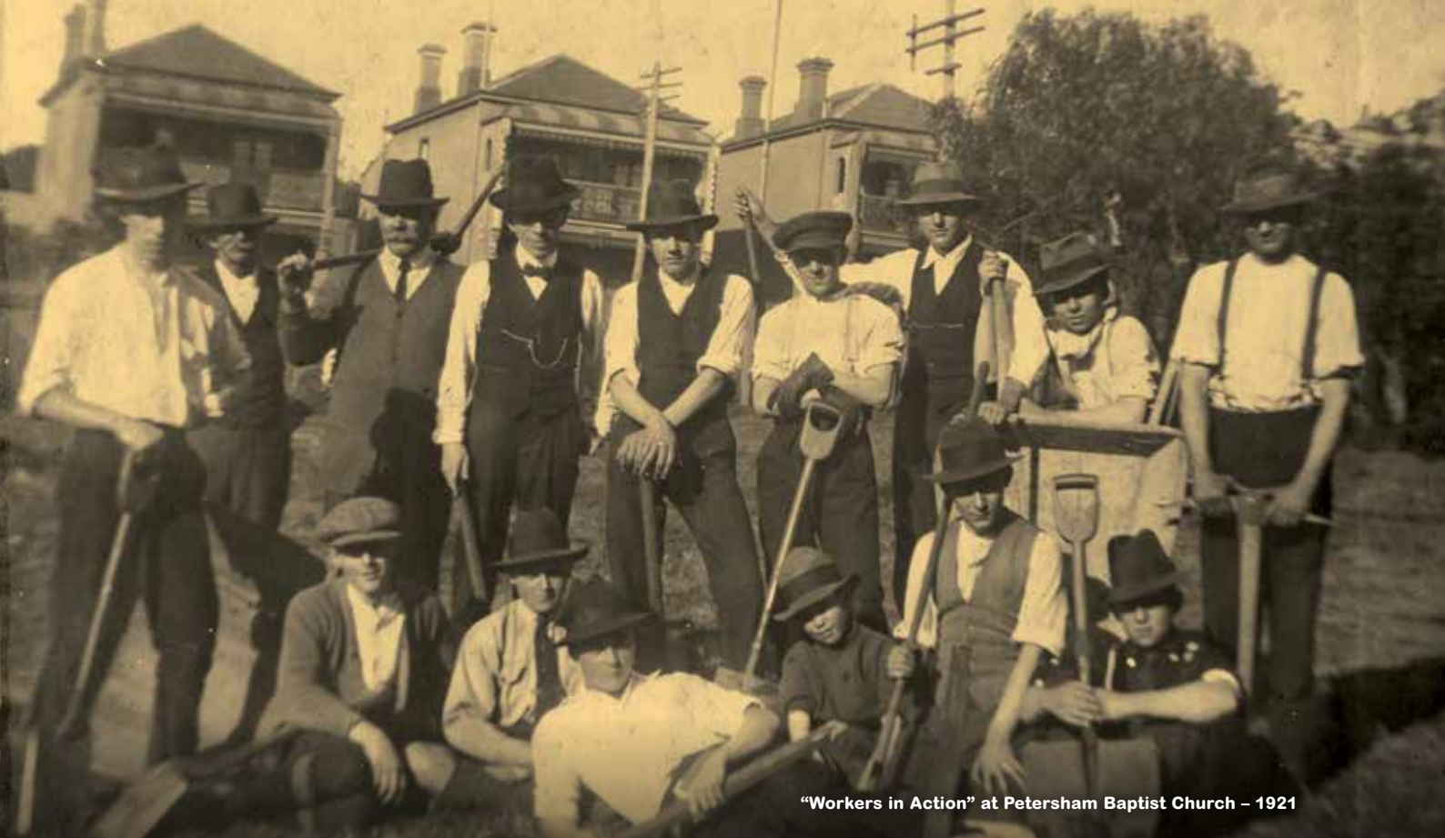
“Workers in Action” at Petersham Baptist Church – 1921

Growth came in fits and starts in the early days of the movement, but as the 20th Century approached a new sense of optimism and commitment to Home Mission emerged. Combined with clear strategy and more adequate resources, many new churches and preaching stations were commenced.