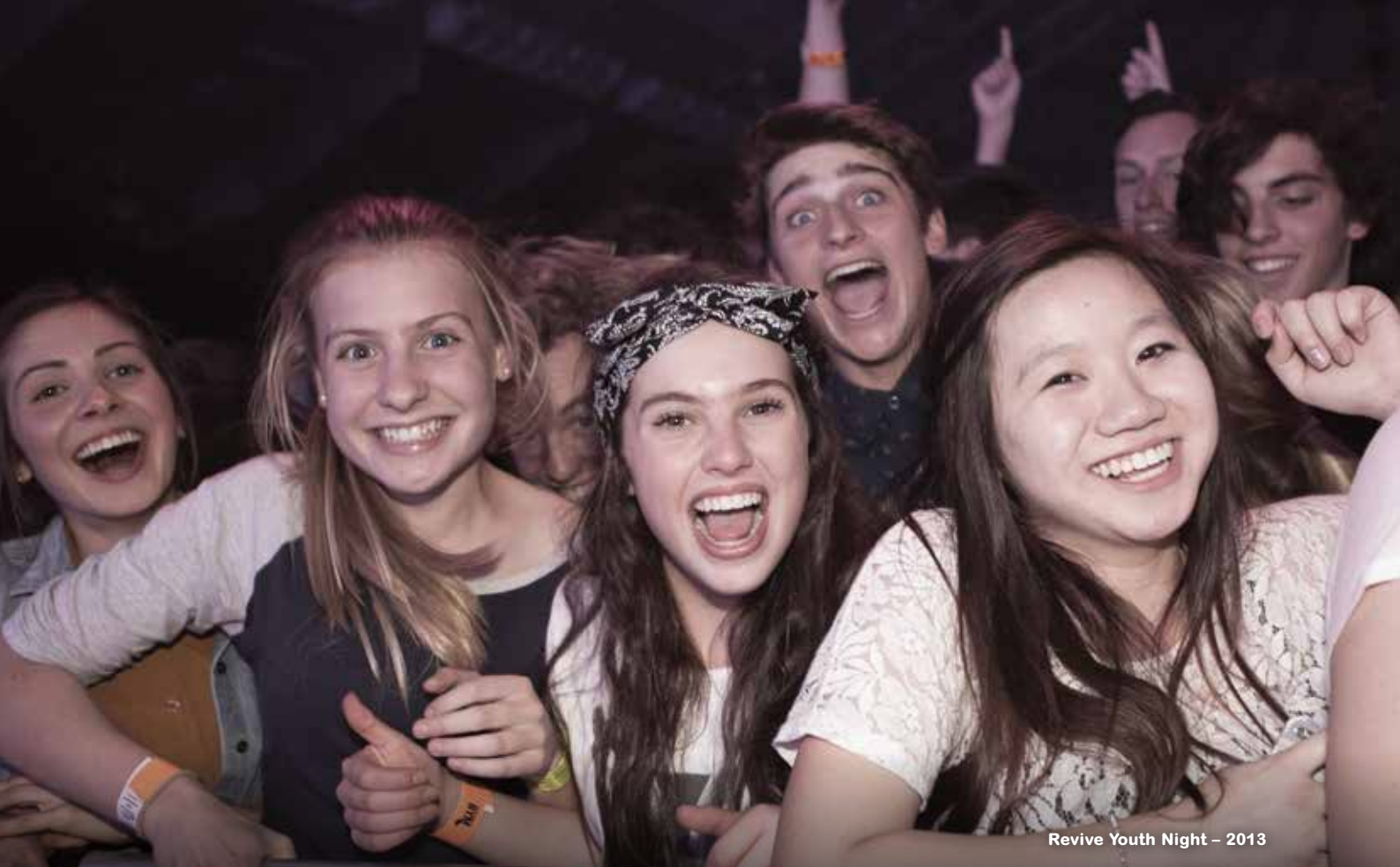
Revive Youth Night – 2013

The growth of the number of churches in the Association led to a need for equipped leaders to pastor churches and disciple new believers. Morling Theological and Bible College began with a goal to raise up, equip and release ministry leaders into churches. The college recently celebrated its 100th year of serving the Baptist movement (and other denominations) and continues to grow and respond to the changing needs of ministry in the 21st century.