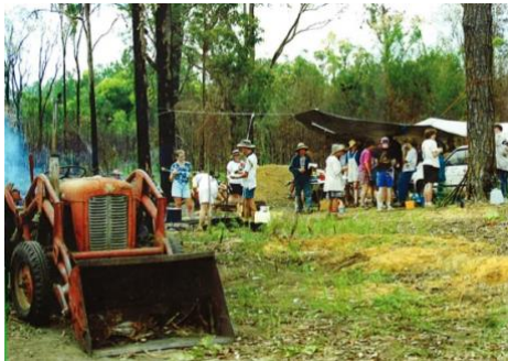
Figure 1 Clearing the land, 1998

Vision Realised: A few miracles later (see https://glasshouse.qld.edu.au/beerwah-history for the back story!), we were blessed with the means to purchase property on Roberts Road. Though it required selling our original church property, this move reflected the unity and purpose within our congregation—always willing to put God’s plan first. For a time, we held Sunday services in rented spaces, while an army of volunteers from the congregation and from Mobile Mission Maintenance built the first demountable classroom of the new school.