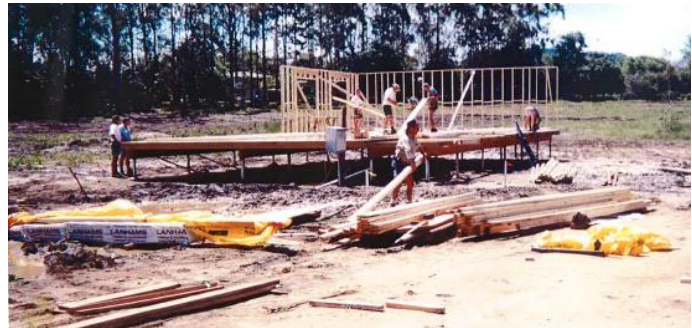
Figure 2 Building the first demountable classroom, 1999

Glasshouse Christian College (GCC) opened in 2000 with 16 students and a small but passionate group of staff. God’s provision was very evident in the early days when money was limited, and by 2003 God led us to complete a new 200-seat church building on the same property, reuniting our church with a physical home.